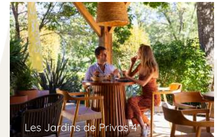
Les Jardins de Privas 4*