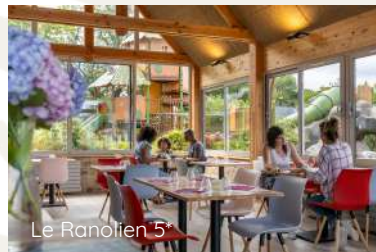
Le Ranolien 5*