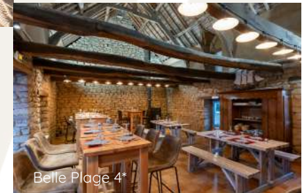
Belle Plage 4*

Campers who prefer to cook for themselves enjoy easy access to grocery stores , supermarkets, bakeries , and other local shops.