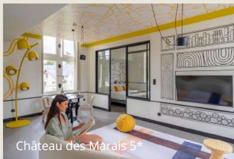
Château des Marais 5*