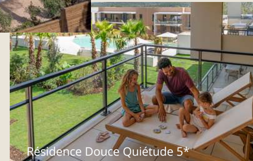
Résidence Douce Quiétude 5*