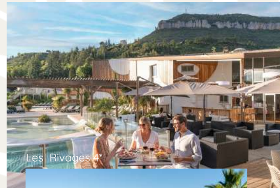
Les Rivages 4*