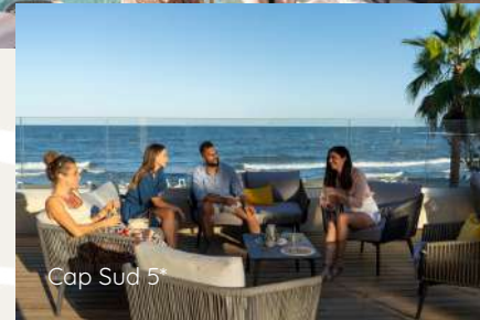
Cap Sud 5*