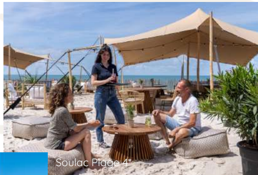
Soulac Plage 4*