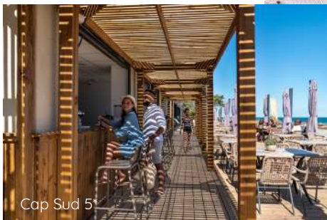
Cap Sud 5*