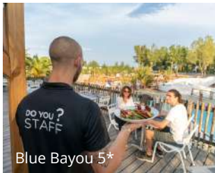
Blue Bayou 5*

Restaurants, snack bars and pizzerias provide quality cuisine and attentive service.